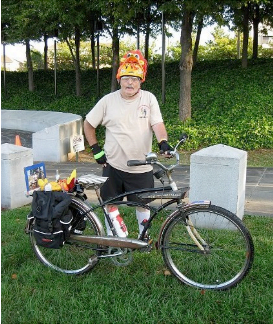
One of the coolest dudes on the ride.