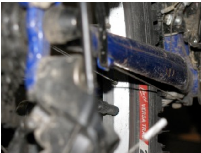
dirty chain stay

10.23.09 in Baltimore , Fred Forever , Gear , General Cycling | Tags: Baltimore , bicycle , bicycles , bicycling , bicyclist , bicyclists , bike , commuting , cycling , fenders , Gear , maintenance , rain , sheldon brown , Weather , winter | by Dan-o | 1 comment