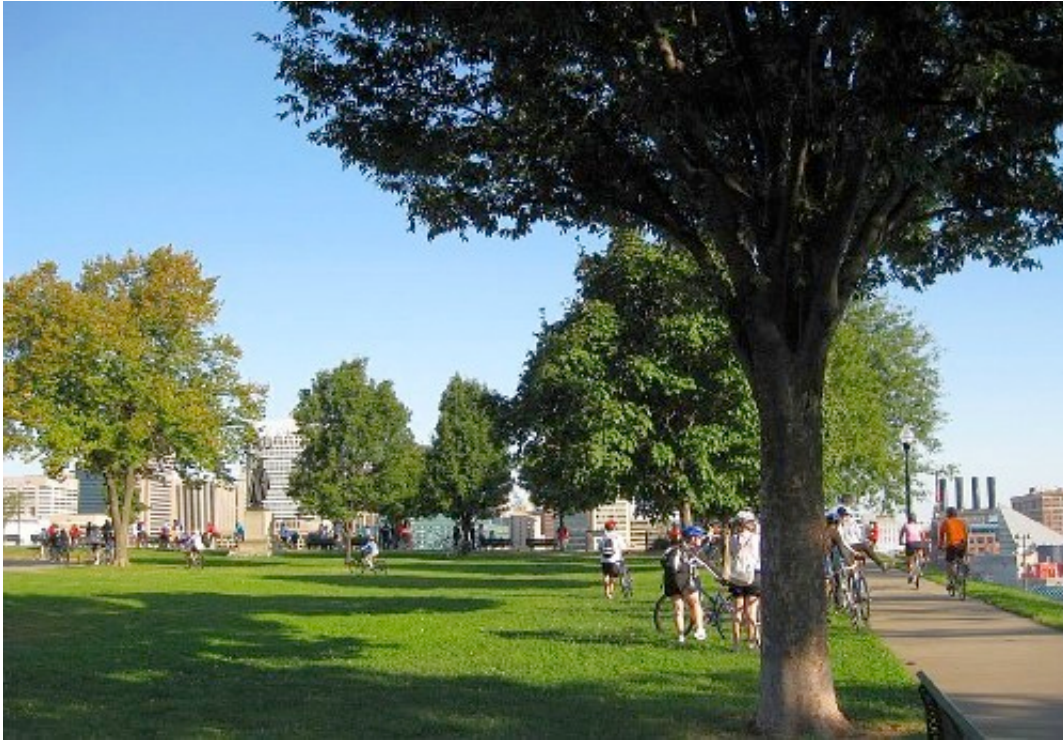
Tour du Port hits Federal Hill.