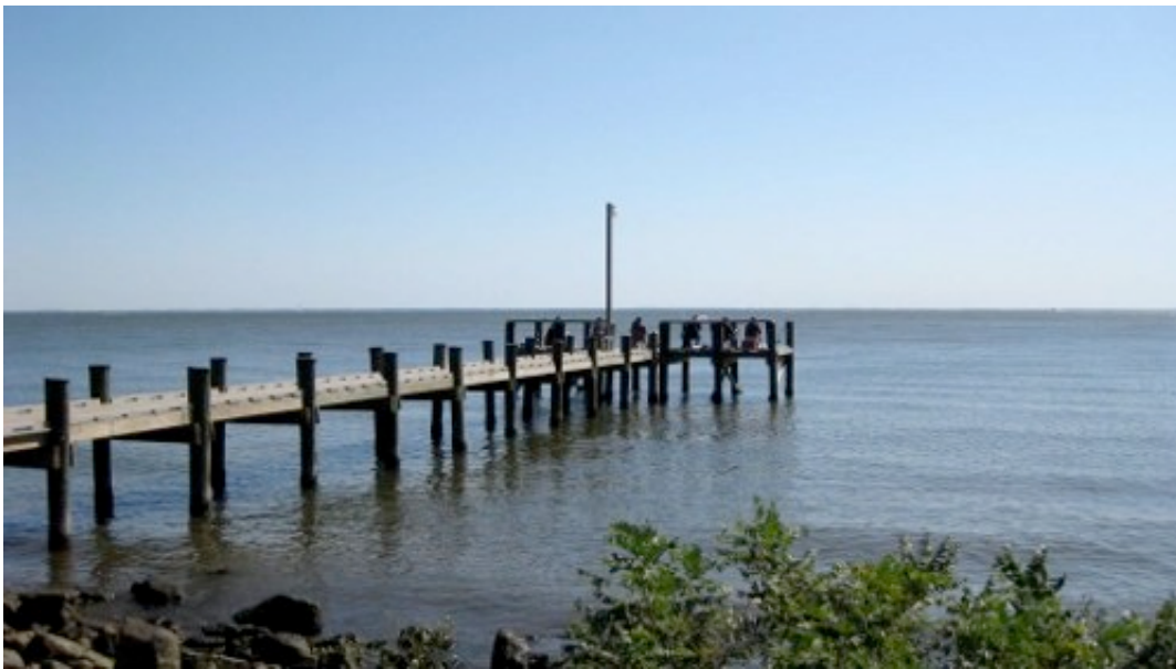
View from the rest stop at North Point State Park.