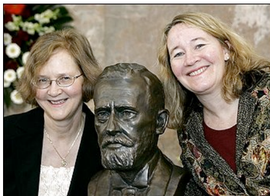
FILE - In this file photo of Saturday, March 14, 2009 U.S. biologists Elizabeth H. Blackburn from San Francisco, left, and Carol Greider from Baltimore pose next to a bust of Paul Ehrlich before they were awarded the Paul Ehrlich and Ludwig Darmstaedter science prize in Frankfurt, Germany. On Monday Oct. 5, 2009 Sweden's Karolinska institute gave the 2009 Nobel Prize in medicine to Americans Elizabeth Blackburn, Carol Greider and Jack Szostak. The institute says the trio was awarded "for the discovery of how chromosomes are protected by telomeres and the enzyme telomerase."